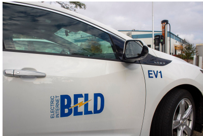
BELD's Electric Fleet Vehicles