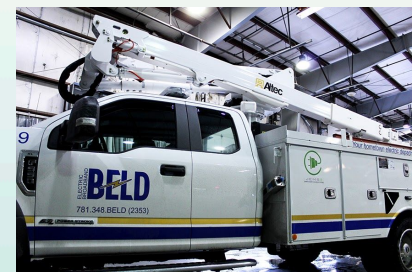
BELD's Electric Bucket Truck

BELD currently owns and operates one Chevrolet Volt, two Volkswagen e-Golfs, and two hybrid bucket trucks, with a third hybrid bucket truck ordered and expected to arrive in 2021. BELD also owns and operates two dual head charging stations, which are free of charge for all electric vehicle users.