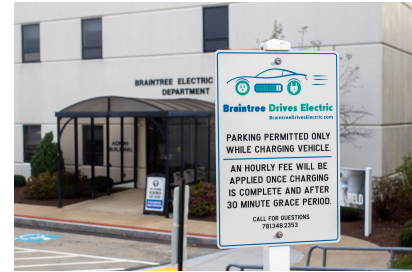
BELD's Charging Infrastructure

The Braintree Electric Light Department's innovative "Braintree Drives Electric" program has been generating awareness and promoting the use of electric vehicles (EVs) to Braintree residents since 2016. The program provides Braintree residents with discounts based on their charging habits and for the installation of charging equipment at their home.